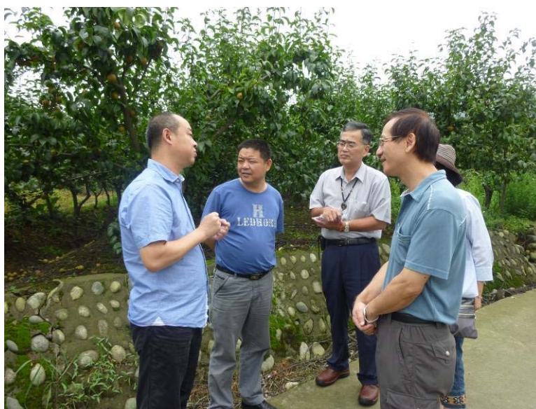
Fig. 1 TFRI researcher team was talking to experts at an agroforestry demonstration site in Sichuan, China.

The Conversion of Degraded Farm Land into Forest Project has been conducted in China for over 10 years. The project is somewhat related to the idea of agroforestry. We visited varied reforestation systems in Pengzhou, Sichuan (Fig. 1), such as orchard, Ginkgo, and Eucalyptus plantation. Under this project, there are many successful cases which improved the live of local people and creating environmental- friendly agriculture systems at the same time. By understanding the implement details and visiting the results, we can learn the advantages from each case.