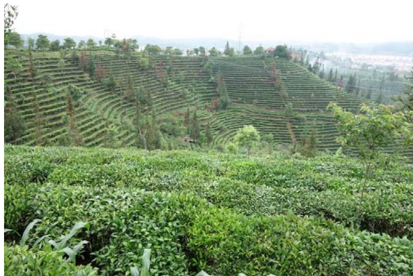
Fig. 5 All hillside tea gardens in Pu'er city, Yunnan Province are advised to interplanted trees.