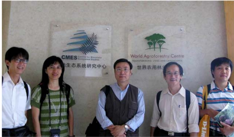
Fig. 4 TFRI researcher team visited the Yunnan office of International Centre for Research in Agroforestry, located at Kunming Botanical Garden.