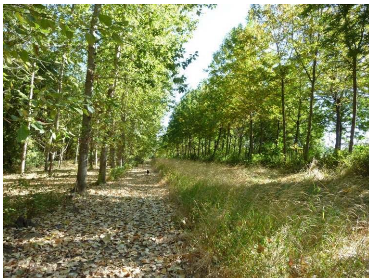
Fig. 2 In Kenagy Family Farms, Columbia brome ( Bromus vulgaris ), a native woodland grass that requires shade, is planted underneath hybrid poplar. They sell Columbia brome seeds for local restoration project uses.